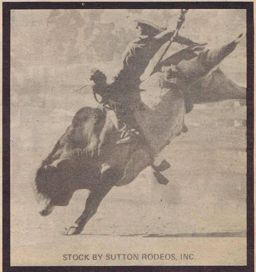
STOCK BY SUTTON RODEOS, INC.